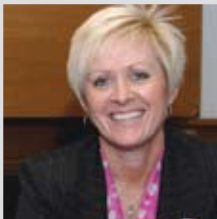
Award winning people Page 2 & 3

In this issue... Belong Warrington - new year new start