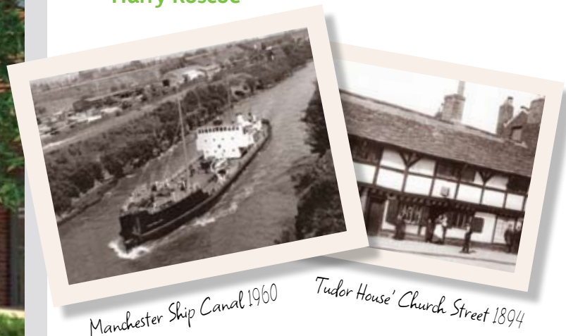
Manchester Ship Canal 1960