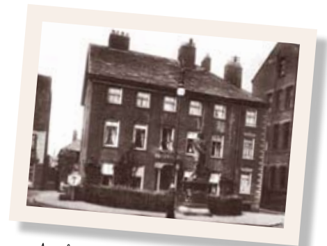
Academy and Cromwell Statue 1901