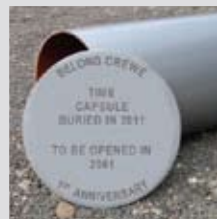
Happy 1st birthday to Belong Crewe Page 9