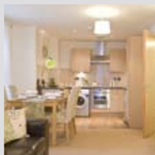
Belong Wigan apartments officially open Page 4