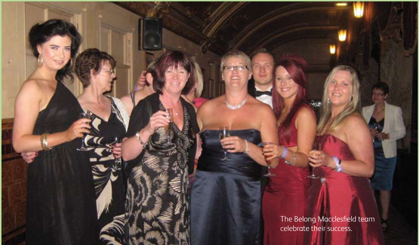
The Belong Macclesfield team celebrate their success.