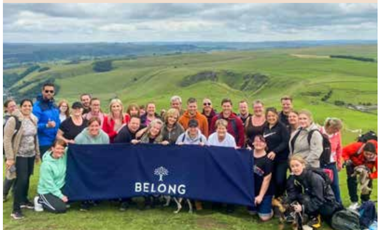
The Big Belong Walk saw over 40 colleagues scale beautiful Mam Tor in the heart of the Peak District.

Colleagues also undertake a range of outdoor challenges, often combining fundraising and team building. These have ranged from hiking in Snowdonia to cycling to Blackpool.