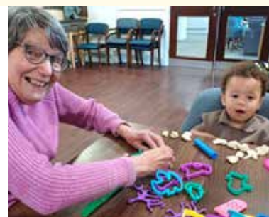
In Belong Macclesfield, a weekly playgroup initiative is helping intergenerational relationships to flourish at the village.