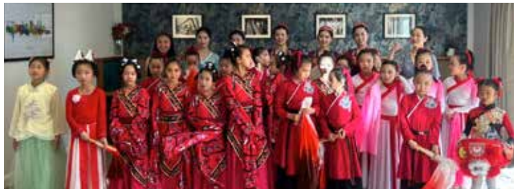
Belong Warrington enjoyed a visit from talented young dancers from the Manchester Chinese Academy of Dance.

Intergenerational opportunities are woven into life at all Belong villages, both through long-term partnerships with local schools, colleges and nurseries, as well as ad hoc opportunities that form part of village events programmes.