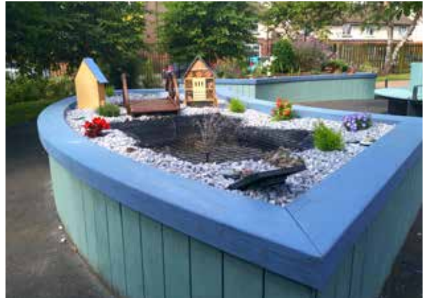
Beach themed raised beds are amongst the striking new features at Belong Newcastle-under-Lyme's accessible gardens.

Our dementia-friendly gardens provide space for residents to relax outdoors, indulge in a spot of gardening or enjoy garden entertainment and barbecues. In addition to the gardens, residents on upper floors have access to spacious balconies to ensure continuous, secure and independent access to the outdoors.