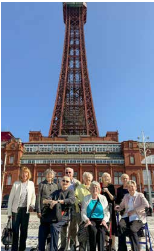
Blackpool was the destination for multiple visits during the course of the year, with Belong Wigan residents enjoying trips to the circus, arcades and the famous illuminations.