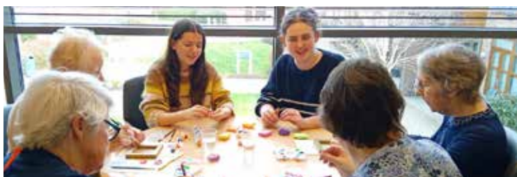
Social care students from Winstanley College ran a series of activities at Belong Wigan, including frame making, clay work and mug decorating.