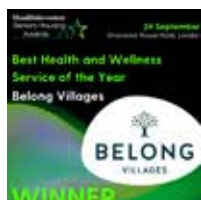
HealthInvestor Awards 2024 Best Health & Wellbeing Service of the Year