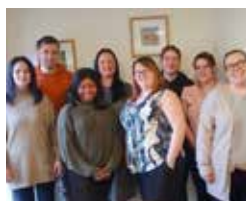
Great British Care Awards 2024 North West Winner: The Care Home Team: Nursing Team, Belong Atherton