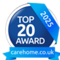
Belong Wigan was listed in the Top 20 care homes in the North West, with a perfect 10 out of 10 rating