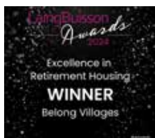
LaingBuisson Awards 2024 Excellence in Retirement Housing

Belong was again recognised in a range of high-profile awards across the year, which are profiled throughout this publication. Some of these can be found below.