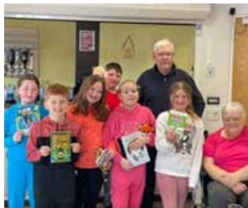
Belong Atherton celebrated World Book Day with a tea party with friends from Parklee Community School.