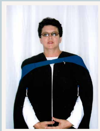
Pictured: Fully qualified: graduation day