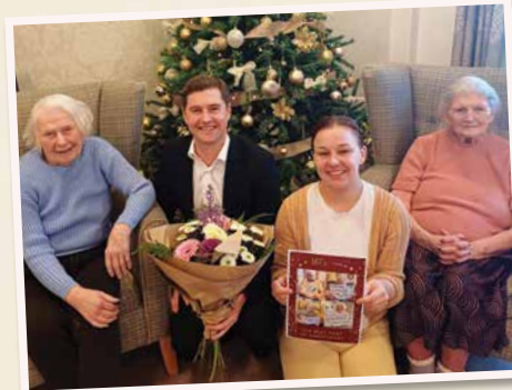
Pictured: Belong Macclesfield Xmas card winners