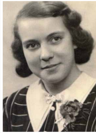
Age 16 (1941)