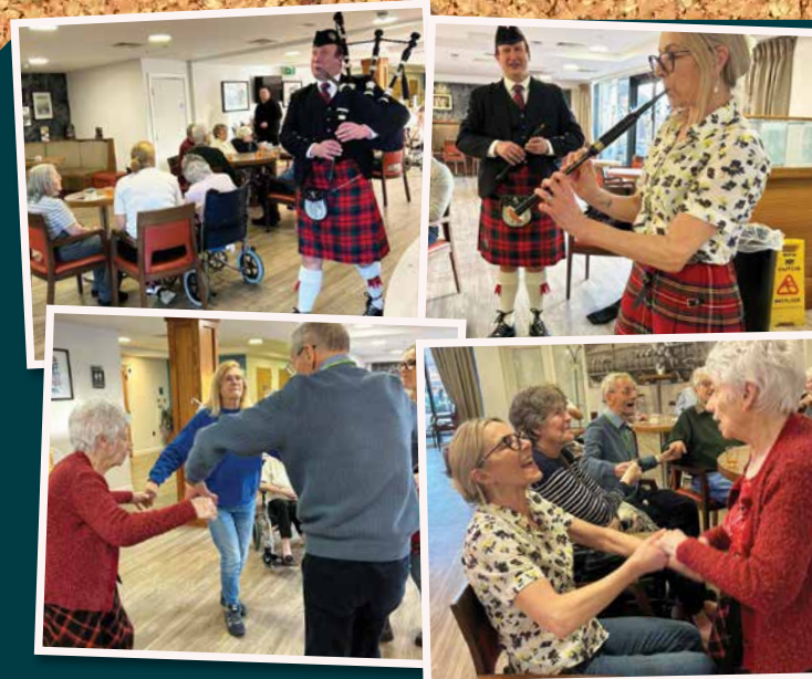
Pictured: Residents enjoying the Scottish celebrations.