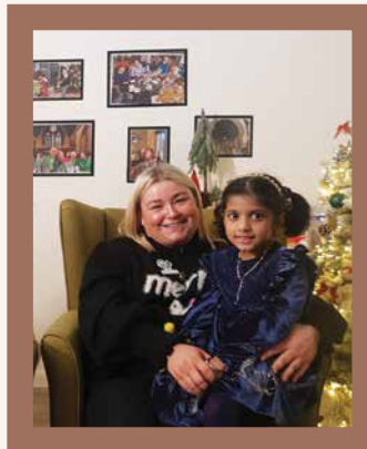
Sankofa Songsters Enjoy TV Debut with Lorraine interview Page 11