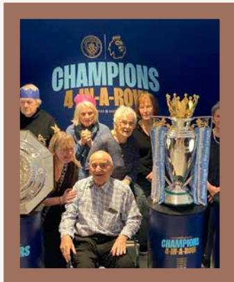
Belong Morris Feinmann residents enjoy VIP visit to Etihad Page 7