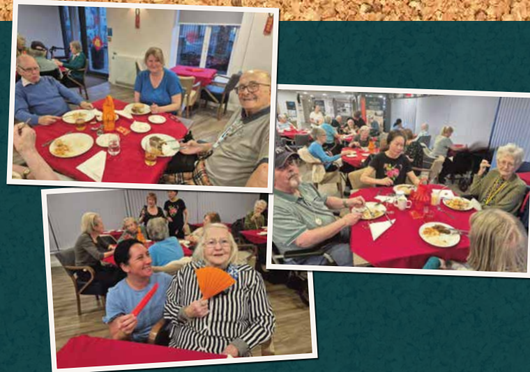
Pictured: Belong Atherton residents enjoying the celebrations.

The atmosphere was alive with the sounds of authentic Chinese music, setting the perfect backdrop for a delicious feast prepared by our talented bistro team. On the menu were classic favourites, including sweet and sour chicken and beef in black bean sauce, served with rice, prawn crackers, and crispy vegetable samosas—a true treat for the taste buds! It was a fantastic evening filled with great food, music, and wonderful company!