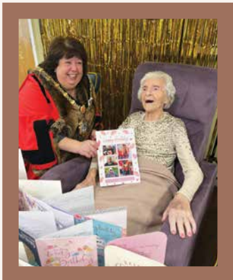
Belong Crewe comes out in force for Ivy's 105th Page 5

Belong Macclesfield remembers special resident at garden opening - pages 2 & 3