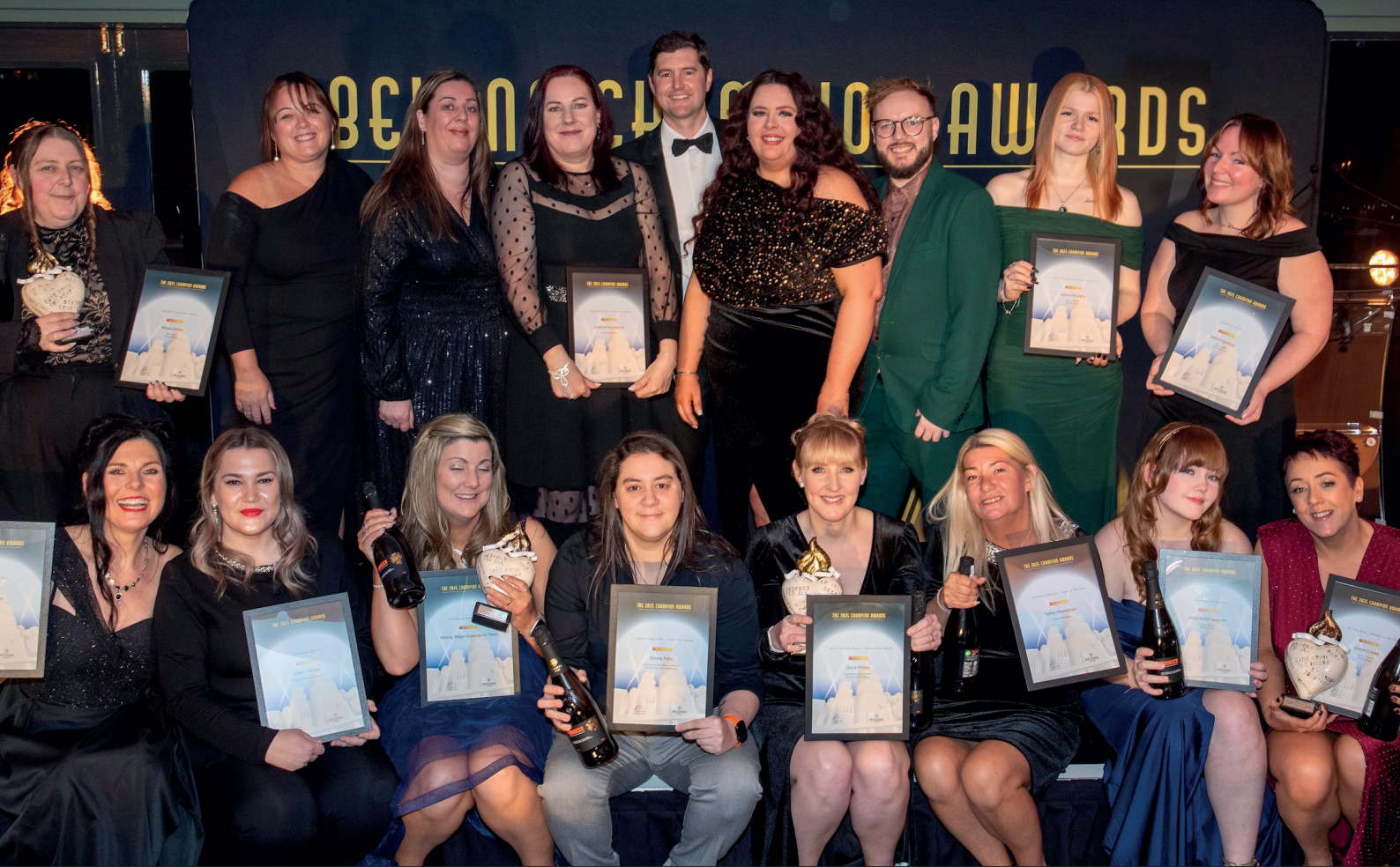
Pictured: Belong colleagues celebrated their success at the annual Champion Awards.