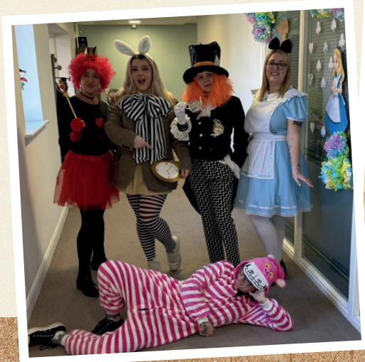
Belong Warrington Residents and Colleagues celebrate World Book Day in style.