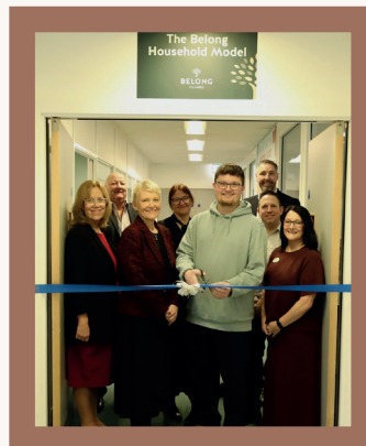
Belong unveil dementia-friendly training facility at Cheshire College Page 10