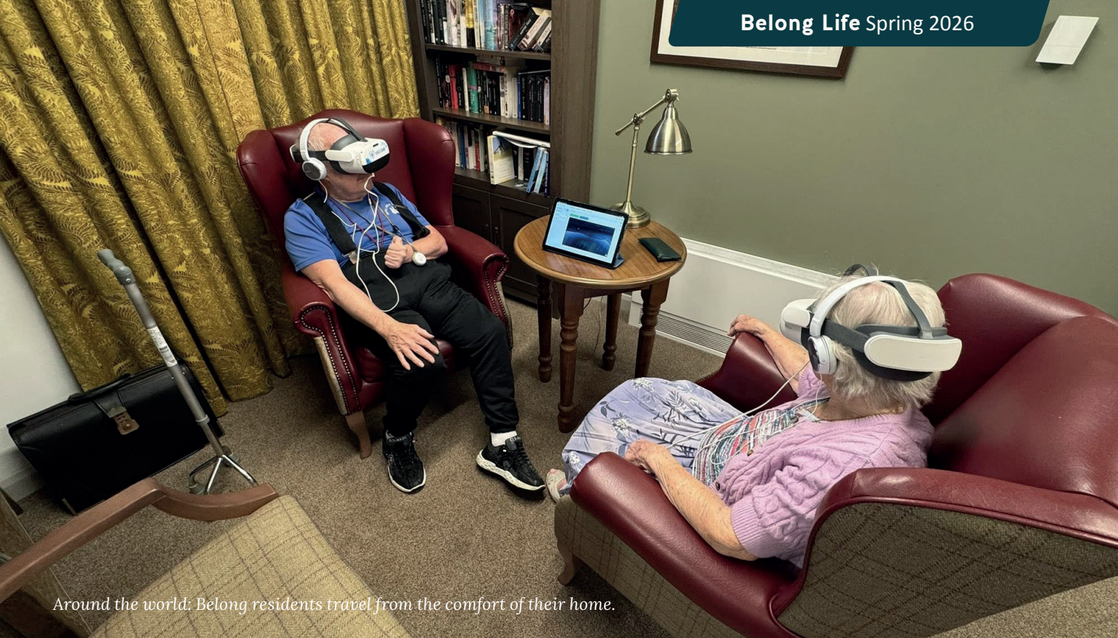
Around the world: Belong residents travel from the comfort of their home.