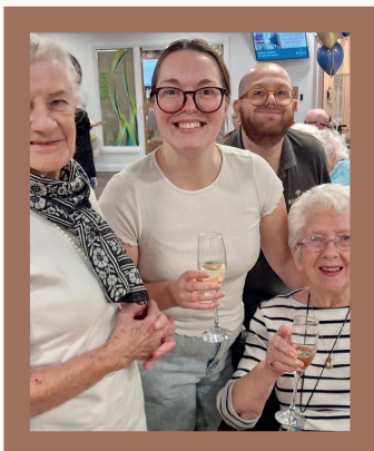
Sweet fifteen: Belong toasts decade-and-a-half in Crewe Page 5

Belong crowned Top 20 Care Home Group on customer review site Carehome.co.uk: See pages 2 & 3.