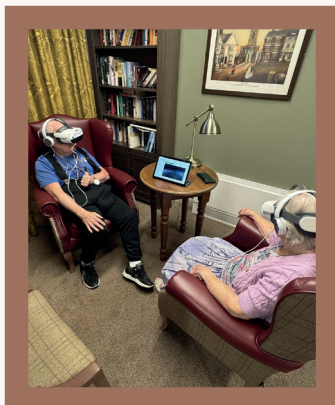
Belong Newcastle-under-Lyme residents race across the world via virtual reality Page 7